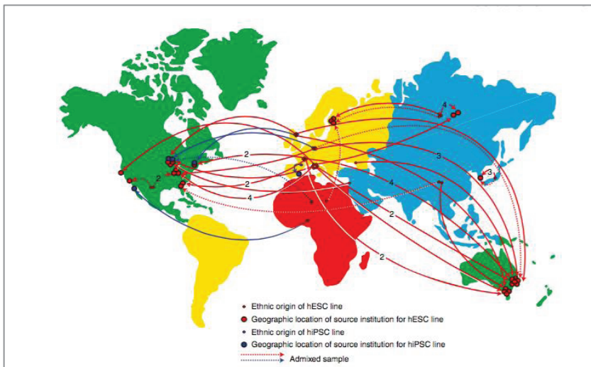
Figure 1. Map of the geographic location of the source institution of hESC and hiPSC lines 75

During my study of the California Stem Cell Research and Cures Initiative, I also observed growing concern among some stem cell scientists that there was a “lack of diversity” in existing stem cell lines. Ethnicity, in this context, was a proxy for genetic diversity. Some researchers, in turn, started mapping the ethnic origin of existing stem cell lines as a precursor to broadening ethnic representation in biobanks (see Fig. 1). 74