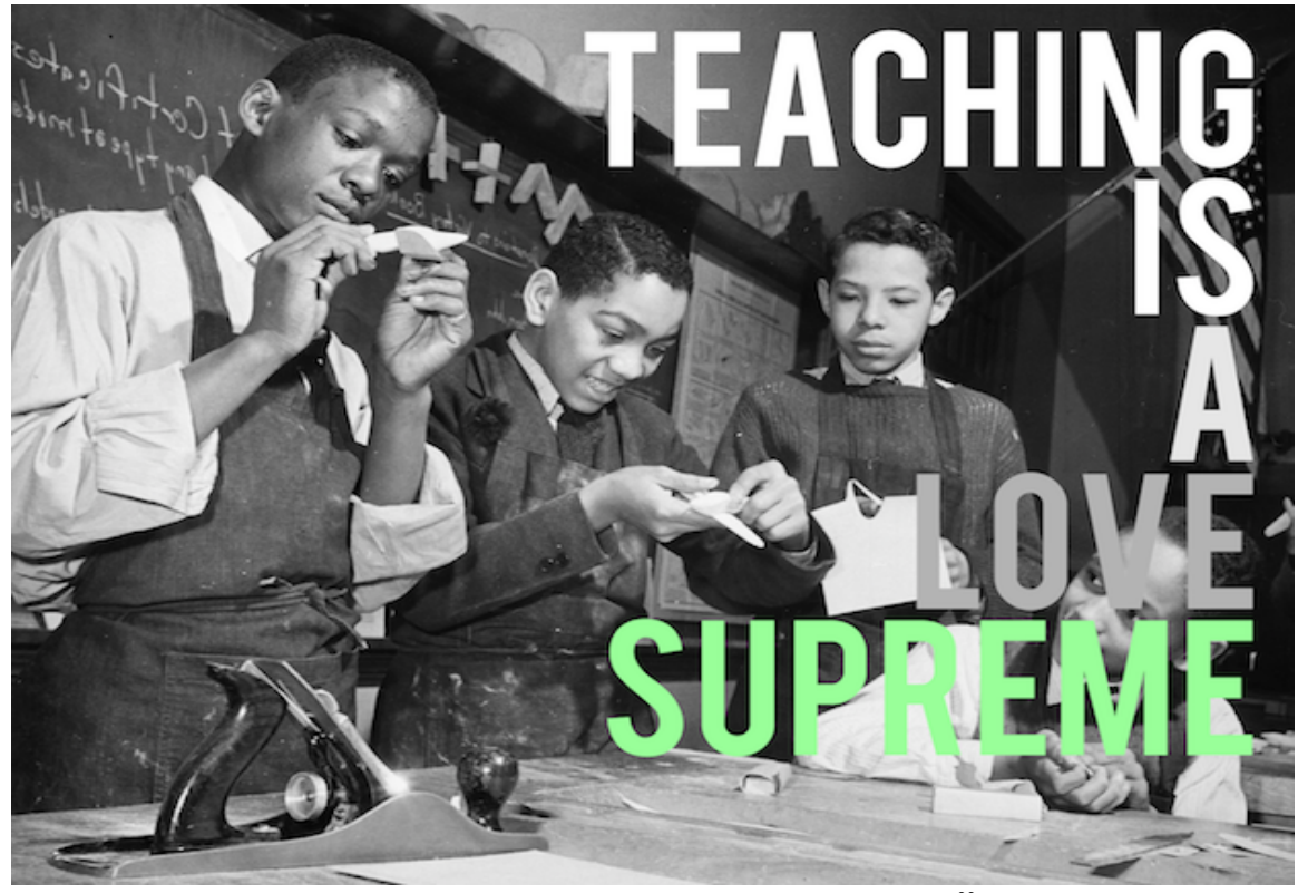
Image Source: "A Love Supreme: Reflections on Why We Continue to Teach."22